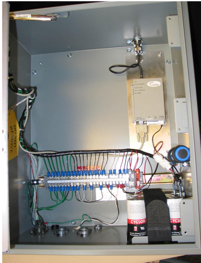
Figure 3 – Finished Integration