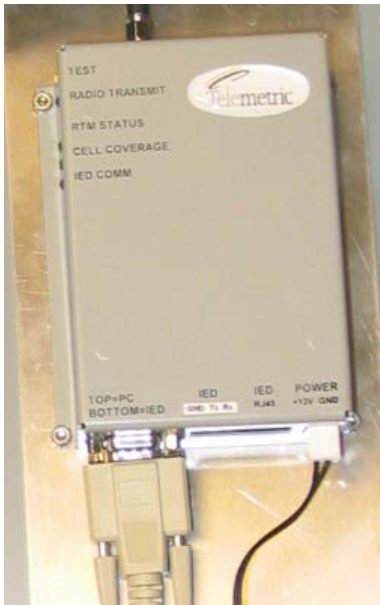
Figure 2 – DNP-RTM Connections